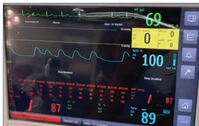
[Table/Fig-3]: Intraoperative Mobitz type 1 heart block.

Spinal anaesthesia was administered uneventfully for the surgery. Approximately 10 minutes after the delivery of the baby and the subsequent oxytocin infusion (20 IU slow intravenous drip), a Mobitz Type 1 heart block pattern [1] was observed on the intraoperative monitor [Table/Fig-3]. A stat dose of Inj. Atropine 0.6 mg was administered, and a pacemaker was kept on standby in case of progression to complete heart block. Within 2-3 minutes, the ECG rhythm normalised, with no further arrhythmias observed [Table/Fig-4]. The patient remained vitally stable throughout and was transferred to the Intensive Care Unit (ICU) for postoperative observation.