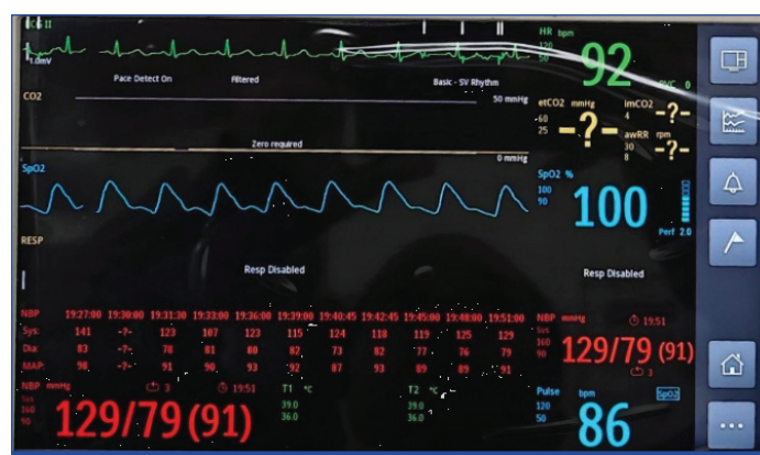
[Table/Fig-4]: ECG was normalised postintervention.

NF1, also known as Von Recklinghausen's disease, is an autosomal dominant genetic disorder caused by a mutation in the NF1 gene on chromosome 17. This mutation inhibits the production of the protein neurofibromin, which regulates cell growth. The disorder is characterised by multiple café-au-lait macules, axillary and inguinal freckling, neurofibromas, and Lisch nodules. High-grade Atrioventricular (AV) block, though rare, is a serious cardiovascular complication of NF1, potentially associated with neurofibromas impacting the cardiac conduction system.