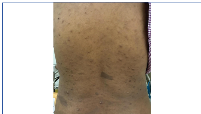
[Table/Fig-1]: Patient had characteristic lesions of NF1- café-au-lait spots and neurofibromas.

The patient, a 34-year-old female at 36 weeks of gestation, was a known case of NF1 since childhood and had been hypothyroid for six years, receiving regular treatment. Upon examination, the patient was vitally stable and exhibited characteristic café-au-lait lesions and neurofibromas all over her body [Table/Fig-1]. No other significant neurological findings were observed. All routine investigations, including thyroid profile, electrocardiogram, and 2D echocardiography tests, were within normal limits [Table/Fig-2].